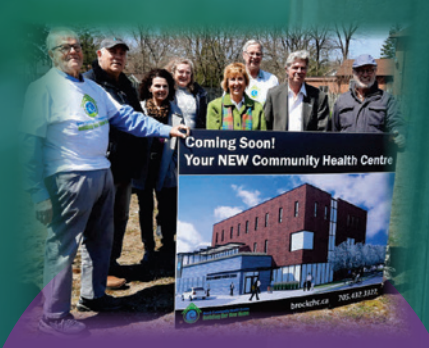
Stage 4.2 submission was approved by the MOH on April 26, 2022.